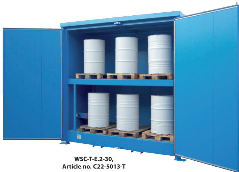
WSC-T-E.2-30, Article no. C22-5013-T