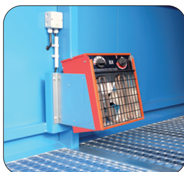
Convection heating, not ex-proof