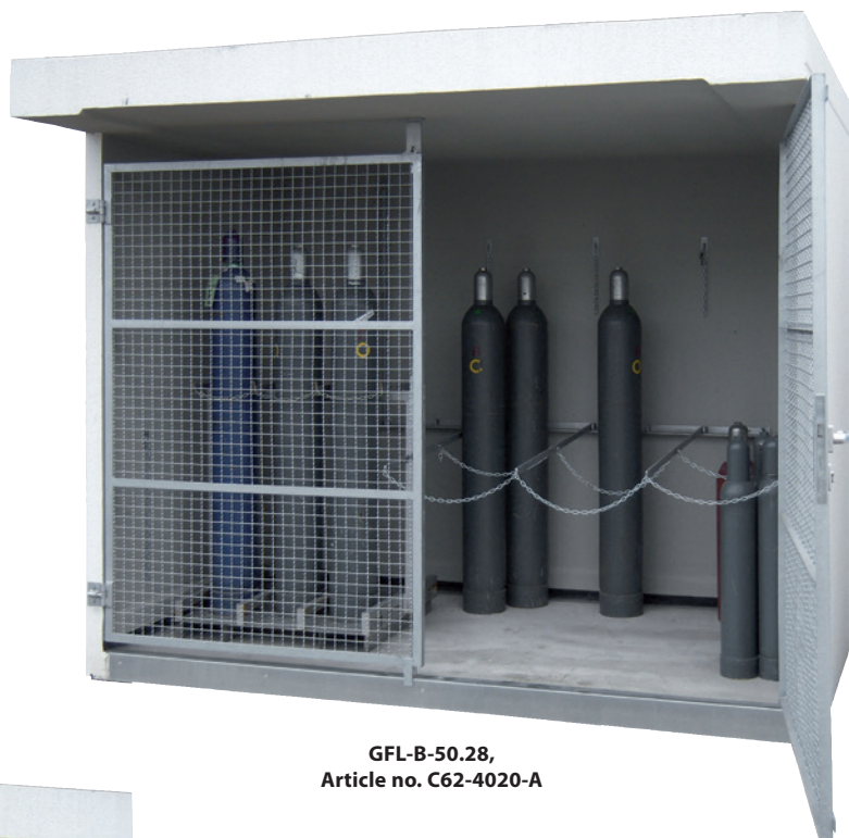
GFL-B-50.28, Article no. C62-4020-A

Flexible storing of single gas cylinders and/or gas cylinder pallets by movable cantilevers is possible.