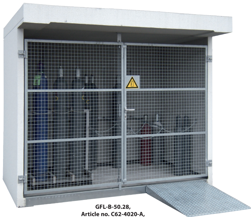
GFL-B-50.28, Article no. C62-4020-A, with optional drive-on ramp