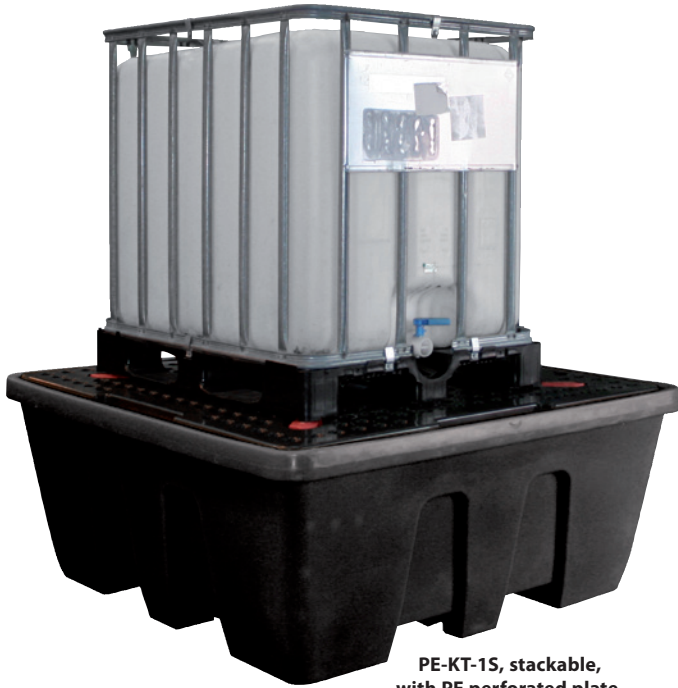
PE-KT-1S, stackable, with PE perforated plate, Article no. P70-2043-A