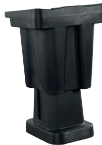
Filling unit for single station, PE-AV-1, Article no. P70-2035-A

Steel sump pallets for 1000 liter containers with filling stand can be found on page 27!