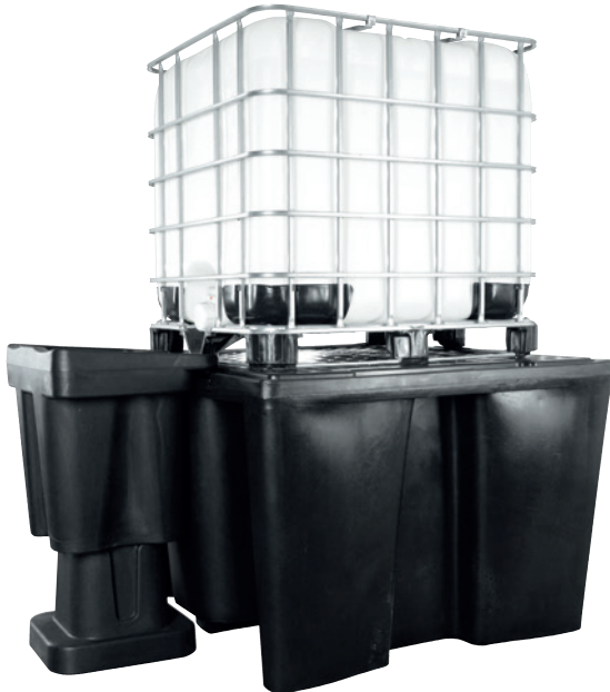
PE-KT-1, with PE perforated plate, Article no. P70-2040-A, with filling unit PE-AV-1, Article no. P70-2035-A