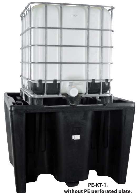
PE-KT-1, without PE perforated plate, Article no. P70-2042-A