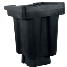
Filling unit for single station, PE-AV-1S, Article no. P70-2037-A