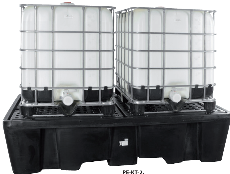
PE-KT-2, with 2 x PE perforated plate, Article no. P70-2041-A