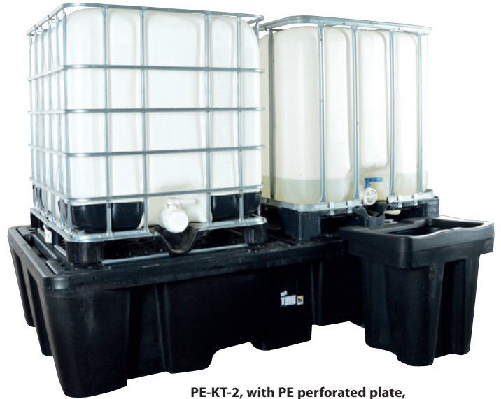
PE-KT-2, with PE perforated plate, Article no. P70-2041-A, with filling unit PE-AV-2, Article no. P70-2036-A