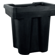
Filling unit for double station, PE-AV-2, Article no. P70-2036-A